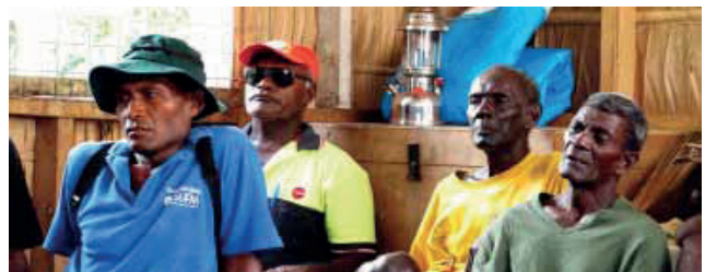
Improve governance and leadership by forming chief councils

In 2012, the Paeloge community participated in a series of climate change adaptation workshops with support from WorldFish, WWF and the Western Province Government. From the workshops, the community identified the above climate change action plan.