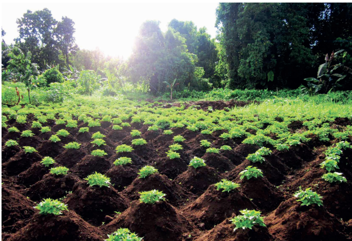
Improve garden productivity by seeking expert advice