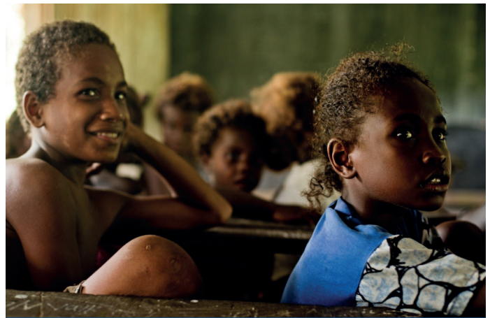
Increase health and nutrition awareness of community members