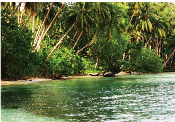
Implement effective reef management systems