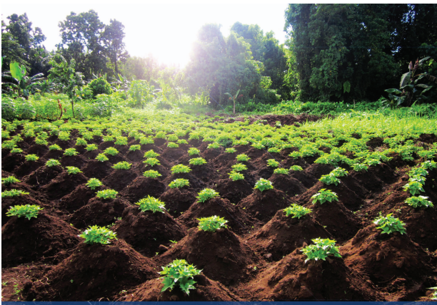
Improve garden productivity by seeking expert advice