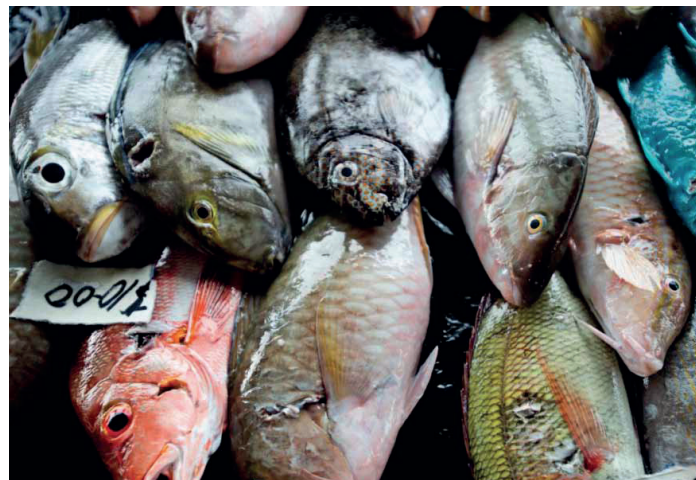
Develop community rules for managing marine resources

In 2012, the Bibolo community participated in a series of climate change adaptation workshops with support from WorldFish, WWF and the Western Province Government. From the workshops, the community identified the above climate change action plan.