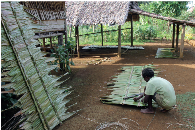
Improve sago palm forest management