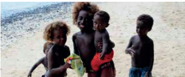
Conduct a family planning awareness program