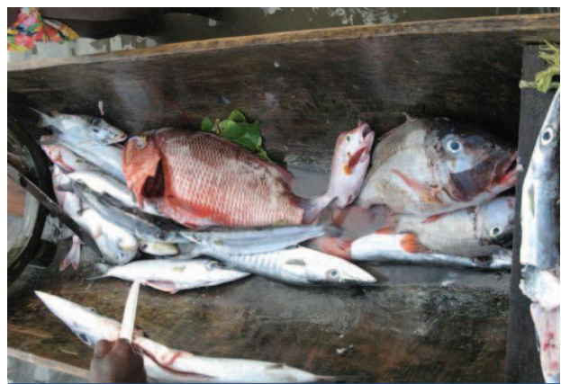
Develop community rules for managing marine resources

In 2012, the Saeraghi community participated in a series of climate change adaptation workshops with support from WorldFish, WWF and the Western Province Government. From the workshops, the community identified the above climate change action plan.