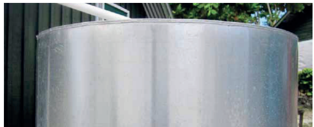
Buy two water tanks for each community in Paeloge