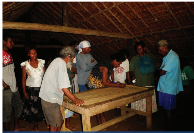
Strengthen community leadership