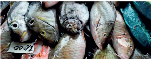
Establish Marine Protected Area committees for each community to enforce marine management rules