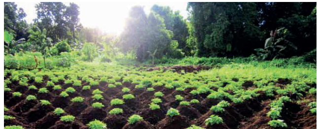
Improve garden productivity by seeking expert advice