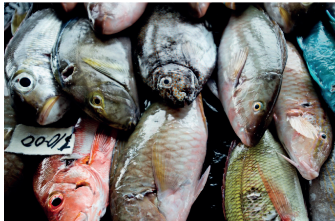
Develop community rules for managing marine resources

In 2012, the Vorivori community participated in a series of climate change adaptation workshops with support from WorldFish, WWF and the Western Province Government. From the workshops, the community identified the above climate change action plan.