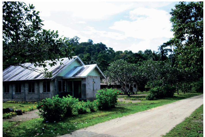
Build a community hall