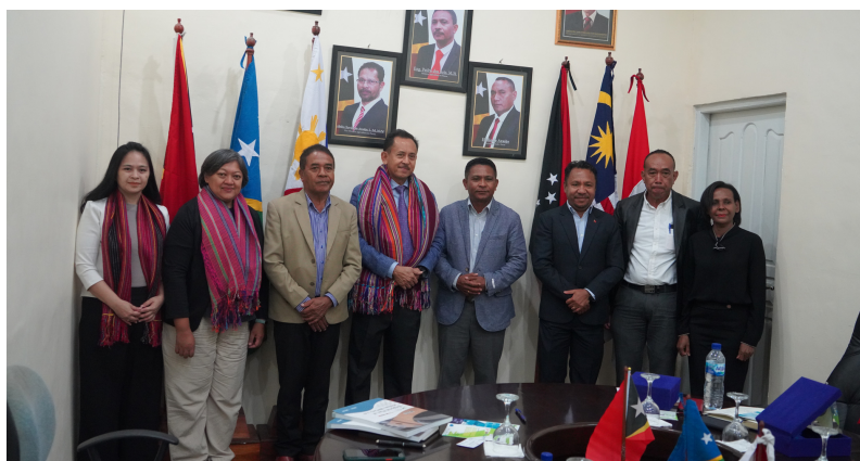
Dili, Timor Leste

The discussion was fruitful and the Timor-Leste Government was very enthusiastic with the role as the leader of CTI-CFF, and will do their best to support and giving guidance wherever necessary. The Minister wished that during his leadership, CTI-CFF can successfully running the Regional Conservation Trust Fund initiative, and most importantly in the implementation of the RPOA 2.0.